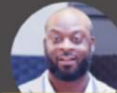
RUBY THE EXTRAORDINARY